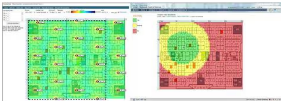
Figure 3. Simplified Wireless LAN Planning and Design

The planning and design tools in Cisco Prime NCS simplify the process of defining access point placement and determining access point coverage areas for standard and irregularly shaped buildings. These tools give IT administrators clear visibility into the RF environment to anticipate future coverage needs, assess wireless LAN events, and mitigate or eliminate improper RF designs and coverage problems.