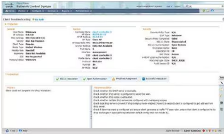
Figure 6. Built-in Client Troubleshooting Tool to Support Step-by-Step Problem Analysis