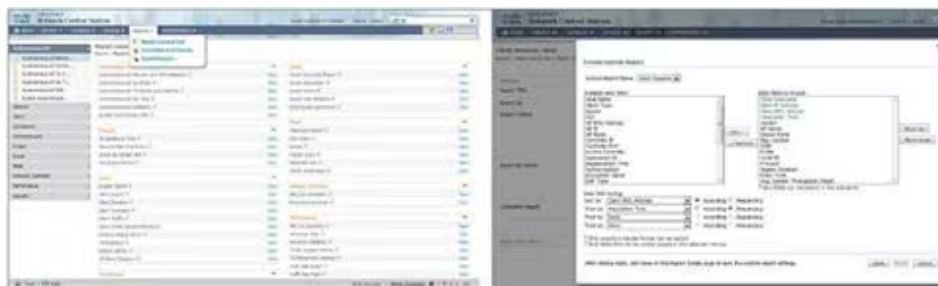
Figure 7. Customizable Reports to Meet Any Requirement

An extensive variety of reports is available to help IT managers stay on top of network trends, maintain network control, perform audit operations, and quickly address changing business and end-user requirements. Reports are customizable based on user-defined parameters. Detailed trend analysis of the network environment, as well as capacity planning, provides a cohesive understanding how the LAN or the WLAN has changed over time in order to project and plan for future growth and enhancements.