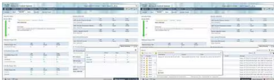
Figure 5. Ever-Present Alarm Summary and Alarm Browser Interaction

The integrated workflows and extensive array of troubleshooting tools in Cisco Prime NCS help IT administrators quickly identify, isolate, and resolve problems across all components of the Cisco access network. Cisco NCS supports rapid troubleshooting of LANs and WLANs of any size with minimal IT staffing. A set of tools works together to help IT administrators understand the operational nuances occurring on the LAN and WLAN and discover nonoptimal events occurring outside baseline parameters (for example, client connection or roaming problems):