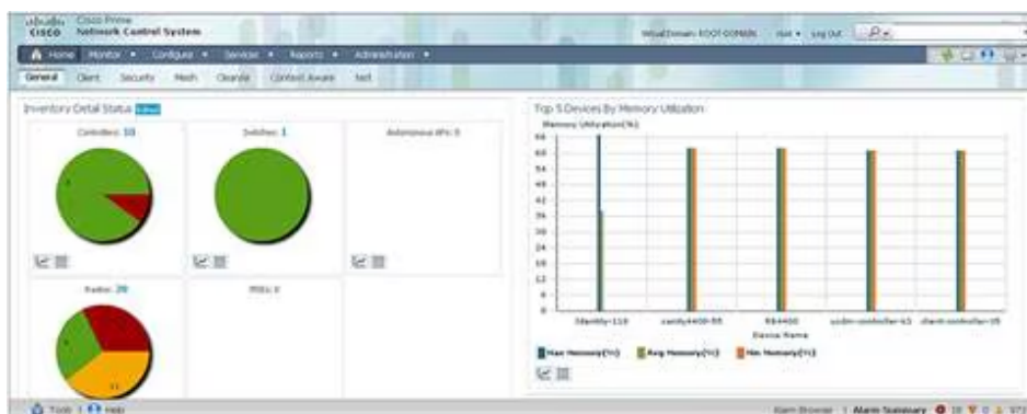
Figure 1. Cisco Prime Network Control System

The platform significantly reduces operational costs by eliminating the need for competing overlay management solutions for wired, wireless, and branch networks, as well as security policy. Built on the foundation of Cisco Wireless Control System (WCS), Cisco Prime NCS: