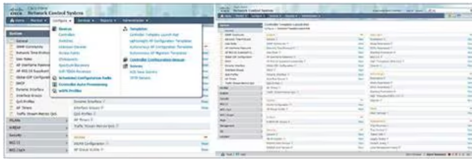
Figure 4. Flexible Deployment Tools and Configuration Templates